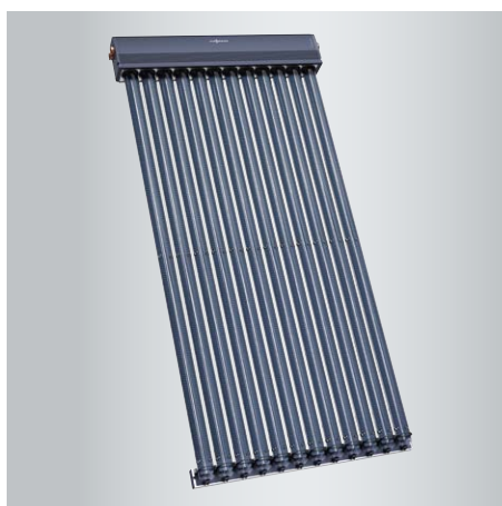
Vitosol 300-TM high-performance vacuum tube collector (type SP3C)