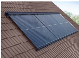
Can be installed vertically, horizontally, on roofs, on building facades as well as free-standing.

With the Vitosol 300-TM, Viessmann offers a high-performance vacuum tube collector that meets the highest demands in terms of efficiency and safety.