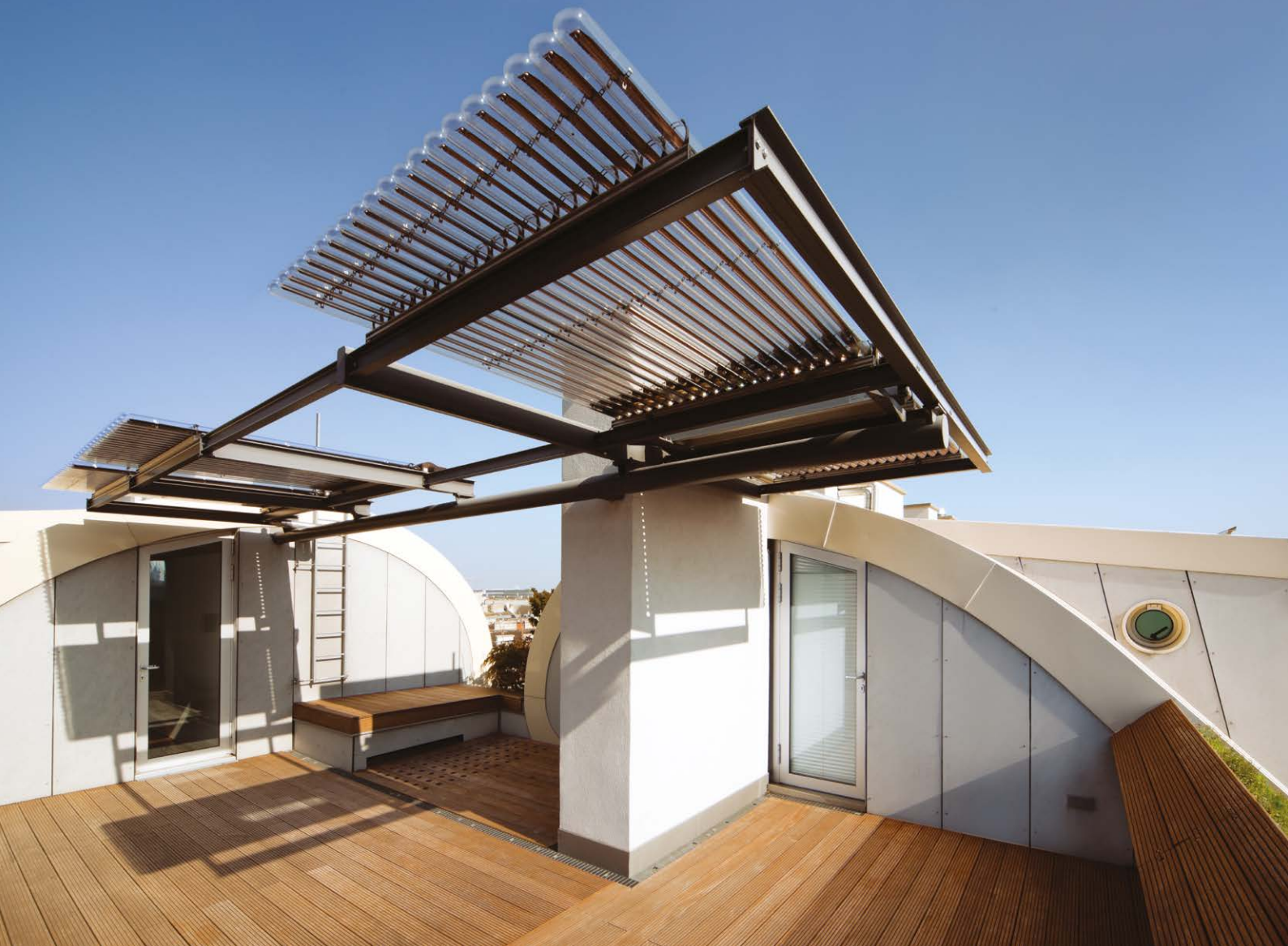
Vitosol 300-TM offers universal application possibilities