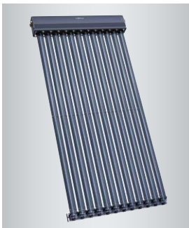
Vitosol 300-TM vacuum tube collector