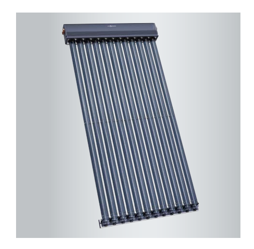
Vitosol 300-TM high-performance vacuum tube collector (type SP3C)