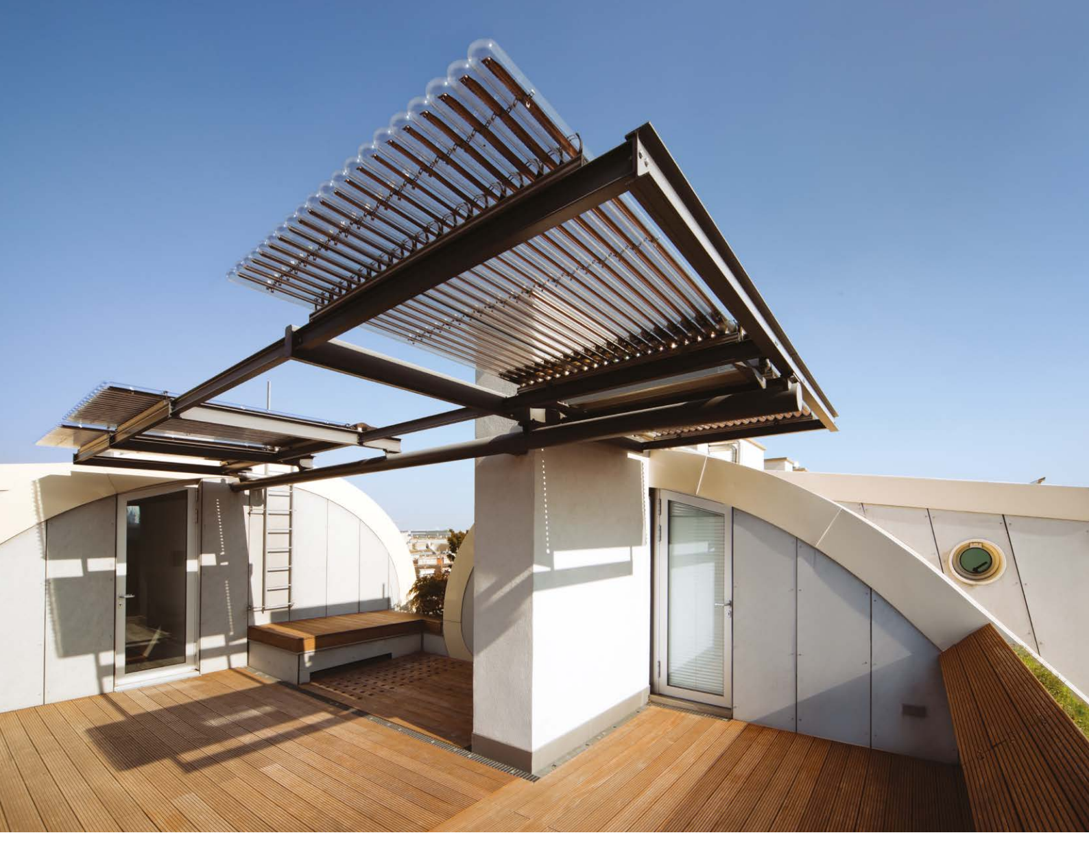
Vitosol 300-TM offers universal application possibilities