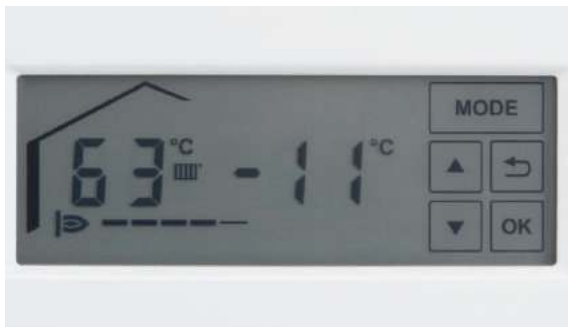
Backlit LCD touchscreen

"A quality product, great price, and in my opinion the best warranty offered over all other boiler manufacturers. They're just the best boiler you could ever fit for your favourite customers." (Which? Trusted Traders heating engineer)