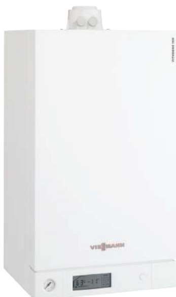
Vitodens 100-W System and Combi options available