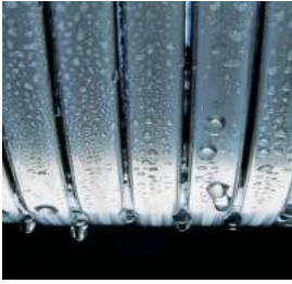
Inox-Radial heat exchanger – durable and efficient